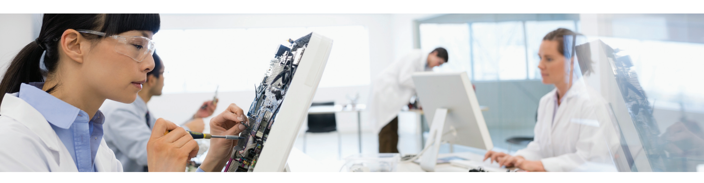
*Nature Research Academies is now part of Nature Masterclasses